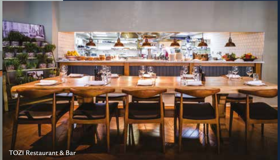
TOZI Restaurant & Bar

The Lounge Bar is a great place to unwind and enjoy a wide range of beers and cocktails, and the bar menu offers quick, tasty snacks.